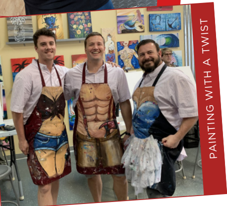
PAINTING WITH A TWIST