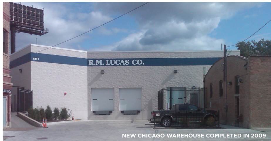
NEW CHICAGO WAREHOUSE COMPLETED IN 2009