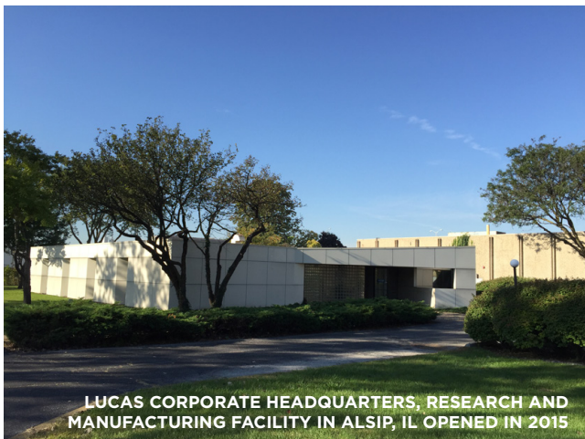
LUCAS CORPORATE HEADQUARTERS, RESEARCH AND MANUFACTURING FACILITY IN ALSIP, IL OPENED IN 2015

R.M. Lucas Company is the developer and producer of professional grade coatings, adhesives & sealants. We are committed to developing new and innovative products to meet and exceed the needs of an evolving construction marketplace. A focus on quality and customer satisfaction for the professional contractor is the foundation of our company and our plan for future success.